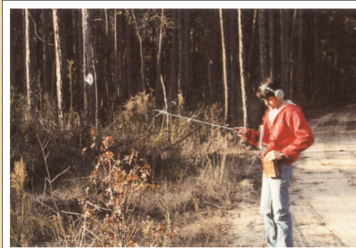
Radio collared deer were monitored for 24 hour periods before and after each raccoon hunt.

The study area was subdivided into two units. The units designated as east side and west side were separated by sufficient distance, such that the deer home ranges on the east side did not overlap with the home ranges of the deer on the west side. On the nights when raccoon hunting trials were conducted, only one side was hunted. The area where raccoon hunting took place was referred to as the "treatment area". The other side served as a control area in order to determine normal daily difference in animal movement which might be attributed to weather, moon phases or other non-raccoon hunting factors.