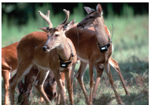
Twenty-seven radio collared deer were used for movement analysis.

The study was conducted on Westvaco's North Whitener Tract, located southwest of Till-