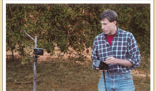
"Trailmaster" cameras were used to monitor deer visitation at food patches.

Deer movement was analyzed using two methods. The first method measured each deer's minimum total distance moved during a 24 hour period (MTD). The second method looked at each deer's MTD broken down into four periods of the day. The four periods roughly represent a morning period, an afternoon period and two night time periods. In order to measure the impact of raccoon hunting, each deer's movement