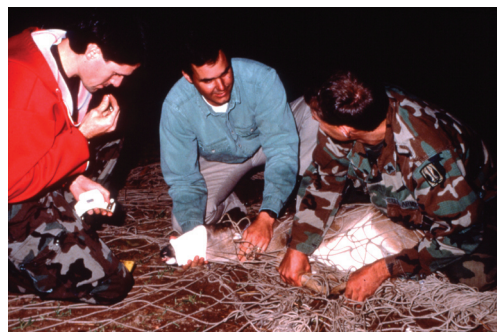
Study animals were captured using rocket nets.

man, South Carolina. The North Whitener Tract is approximately 7,769 acres in size and lies in the Savannah River flood plain forest. Low elevations are characterized by bottomland hardwood and bald cypress/water tupelo wetlands. Higher elevations are characterized by sand ridges that are dominated by stands of planted loblolly pine. Westvaco has owned and managed the area for