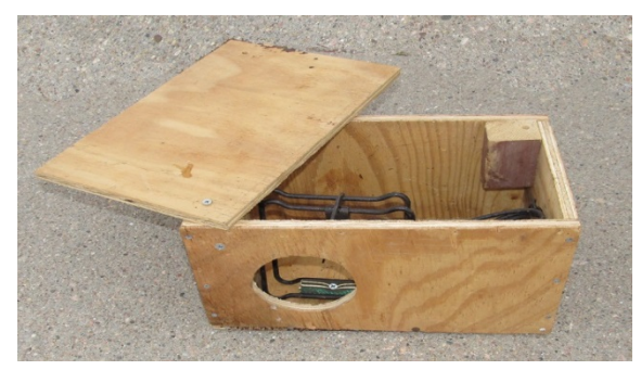
get to the bait in the rear of the box. Figure 3. A box holding a No. 110 conibear-style trap for mink.

trap so that the mink must pass through it to