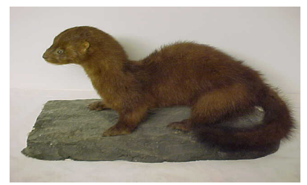
Figure 1. The mink ( Mustela vison ).

Prepared by the National Wildlife Control Training Program. <a href="http://wildlifeControlTraining.com">http://wildlifeControlTraining.com</a> Researched-based, certified wildlife control training programs to solve human – wildlife conflicts. Your source for animal handling, control methods, and wildlife species information.