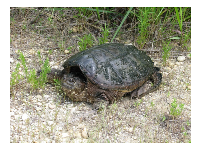
Figure 1a. The common snapping turtle ( Chelydra serpentina ).

Prepared by the National Wildlife Control Training Program. <a href="http://wildlifeControlTraining.com">http://wildlifeControlTraining.com</a> Researched-based, certified wildlife control training programs to solve human – wildlife conflicts. Your source for animal handling, control methods, and wildlife species information.