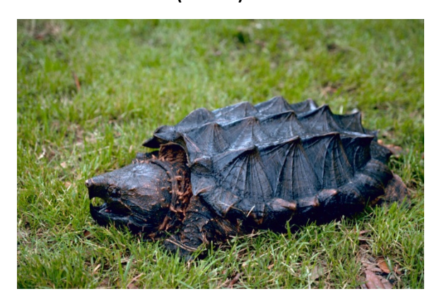
Figure 1b. Alligator snapping turtle ( Macrochelys temminckii). (South Carolina is not in the range for Alligator snapping turtles – remove?)