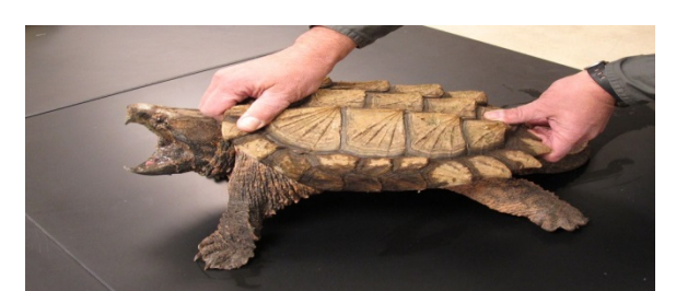
Figure 3. Proper hand position for grasping the shell of a snapping turtle (alligator snapping turtle pictured).

Turtles can be removed directly. For most turtles, simply grab them by the shell. Snapping turtles (including the Alligator turtle) require care to avoid being bitten. Snappers may be grasped safely by the tail, but this technique can be difficult to sustain and may injure the turtles. A preferable method is to approach the turtle from the rear, and place one hand on the back portion of the shell. Reach over with your other hand, knuckles facing the top of the snapping turtle's head with fingers cupped, to grasp the top end of the shell (Figure 3). Use your knuckles to keep its head down. Release by quickly moving your hands to the rear of the turtle to avoid being bitten.