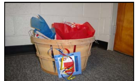
Each Class received a basket filled with class room supplies !

schools that sent in coloring sheets were Parker, Johnston, Douglas, Merriwether. Each classes received a basket full of classroom supplies and something special for each student. I would like to thank each and every teacher and student that made our contest a HUGE success. The district looks forward to another great turn out next year.