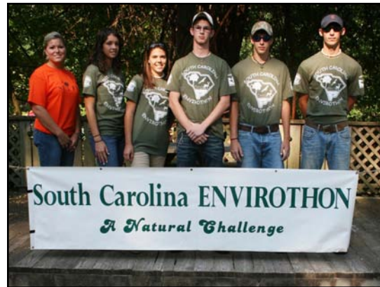
Two Teams that the Edgefield District Sponsored from Strom Thurmond .