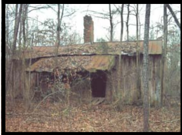
First Place Photo Winner:

The Edgefield Soil and Water District held its annual photo contest in February. The contest was open to all 7th grade students that attend Edgefield County Schools. The theme for this year's contest was rural life. The students were asked to take photos of old barns and buildings, or grazing cows. Just using your imagination was the biggest thing we asked. The photos were judged on composition, originality and effectiveness of the theme or category. We received about 25 photos in the contest this year. The First place winner received a MP-3 player Second and third place received cash prizes and fourth place received a McDonald's gift card. We would like to give a special thank you to all of the students and teachers that participated in this years contest. We look forward for another successful contest next year.