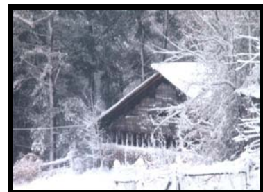
Forth Place Photo Winner: