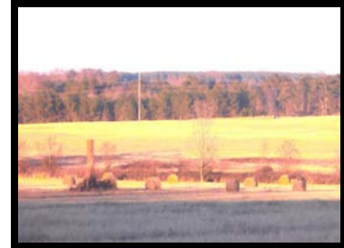
Second Place Photo Winner: