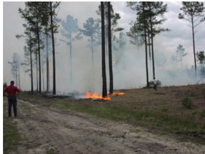
Prescribed Burn at Mt. Pleasant Plantation

WHIP provides cost share assistance for wildlife habitat improvements. Eligible land includes forest land and cropland. Practices available include prescribed burning, permanent firebreaks, native grasses, trees and shrubs, control of invasive species and trunks for wetland habitat management. In 2008, 3 contracts were approved and funded.