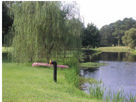
Dry Hydrant at Rural Hall Plantation

Technical assistance for the design and installation of Dry Hydrants is provided to Georgetown County Fire Department with Georgetown County Public Works providing the equipment and labor to install the systems. Dry Hydrants provide an access to a water source for fire protection. Hydrants are installed in private ponds for use by the surrounding community in case of fire. The dry hydrant shown below is located at Rural Hall Plantation. The hydrant head was painted to blend in with the surrounding area.