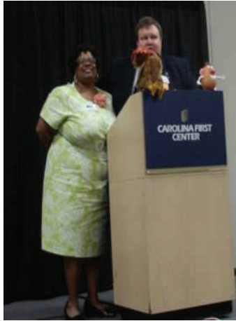
Kirby Player with a brave volunteer at this year's banquet