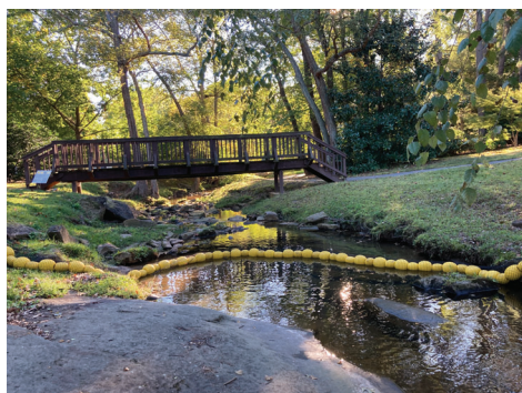
The WATERGOAT on Persimmon Creek on the USC Upstate Campus, installed 10/5/2022. Ready to catch litter!

Through additional state appropriated funds, Spartanburg Soil and Water Conservation District was able to purchase, install, and maintain a WATERGOAT on a local stream. WATERGOATs offer an excellent opportunity to spread awareness about non-point source water pollution and litter, while also taking action to help resolve the issue. The WATERGOAT floats on the surface of Persimmon Creek with a weighted net that hangs about 12" down into the stream. The device catches and holds litter that otherwise would flow downstream, breaking into smaller and smaller pieces until they become very hard to remove. As the WATERGOAT is located in a high traffic portion of the arboretum walkway, it's visibility attracts curious visitors to the nearby educational signage with a QR code that leads to the district's website with further information about WATERGOATs, litter, water quality and the district. The litter collected is sorted, counted, disposed of properly, then the data is shared with the SC Aquarium's Litter-Free Journal. More than 784 pieces of trash and 5 full trash bags have been removed by the WATERGOAT!