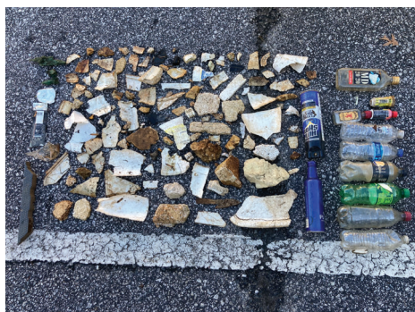
The WATERGOAT is cleaned as necessary. Most of what is removed is styrofoam and other environmentally harmful plastics.