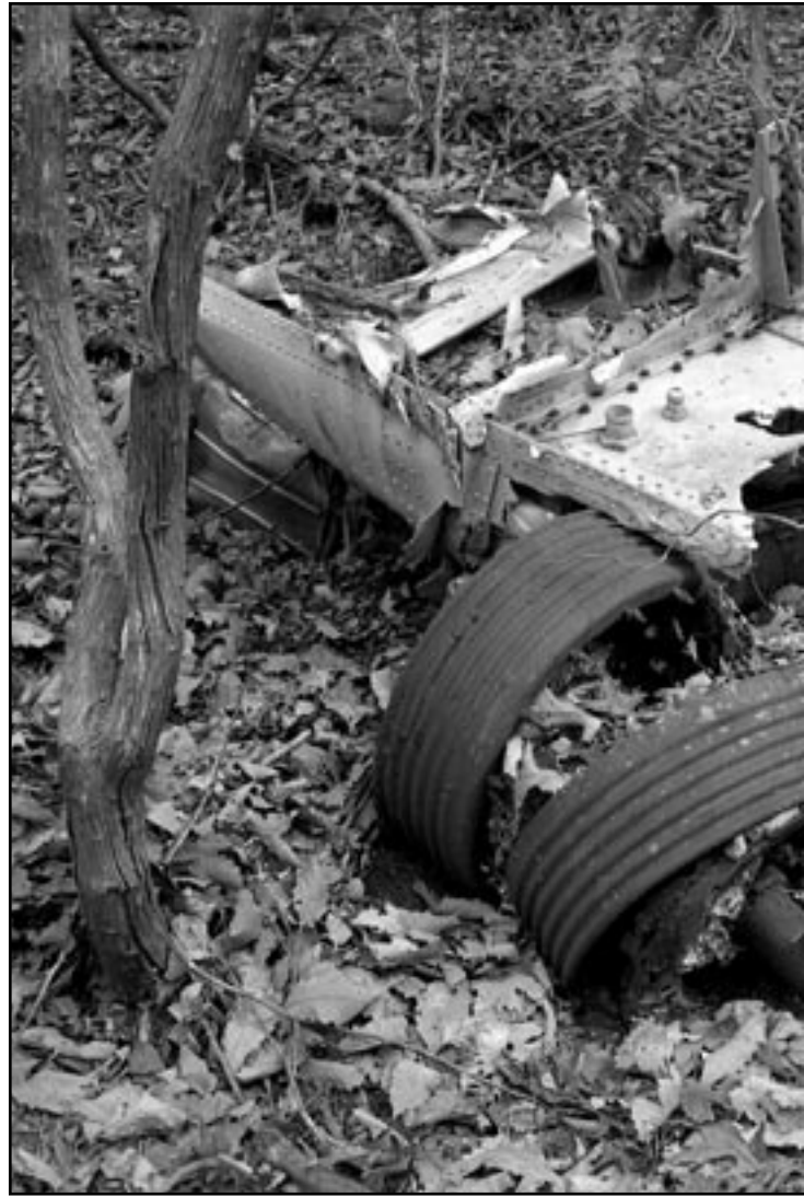
The largest piece of the C-82 twin-engine "Flying Boxcar" wheels.