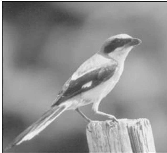
The loggerhead shrike, a species in decline, would potentially be helped in South Carolina by the Comprehensive Wildlife Conservation Plan.

The South Carolina DNR is in the process of writing a Comprehensive Wildlife Conservation Plan as part of the requirement for the State Wildlife Grants program instituted by the federal government, required to receive millions of federal dollars for wildlife in