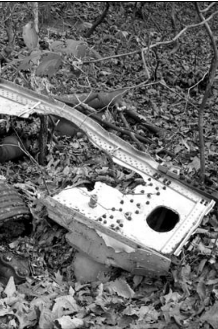
car” left at the crash site is the landing gear and

our people n the line of country, and knows about nice if we could h a veteran’s o put some kind arker on the e should be memorial for these is Chastain