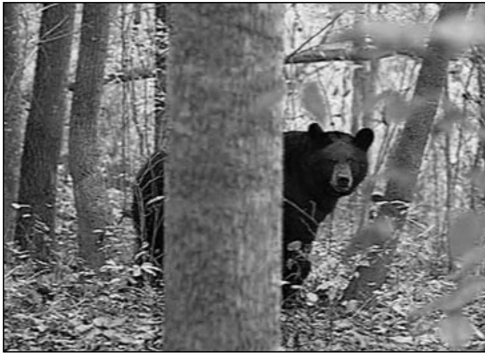
Hunters recorded the best black bear season ever in South Carolina in 2003 with a harvest of 55 bears.