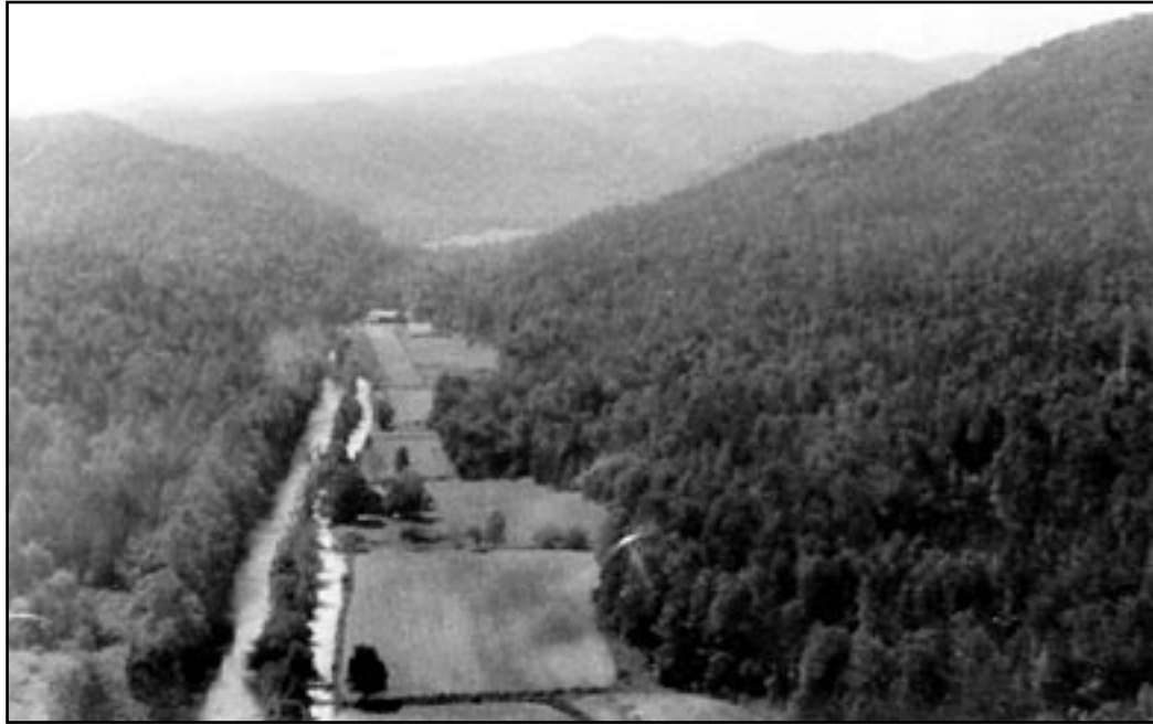
Jocassee Valley as it appeared prior to Lake Jocassee. The Whitewater River can be seen along the left side of the photo, and Attakulla Lodge, which offered bed and board in Jocassee Valley, is seen in the distant center.