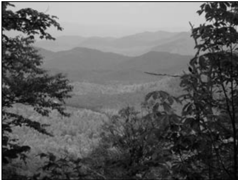
The Natural Resources Conservation Service spent hundreds of hours assisting DNR with soil and water planning conservation in Jocassee Gorges.