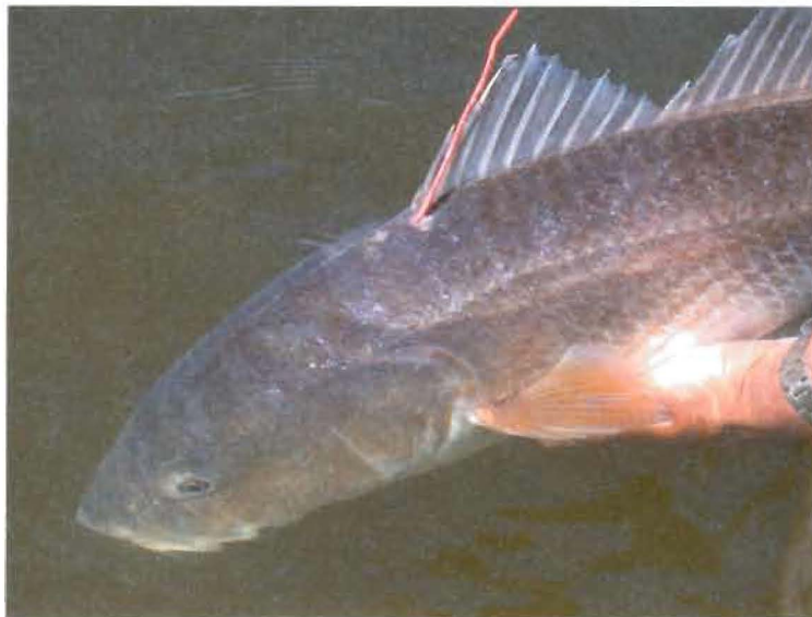
Red Drum, Sciaenops ocellatus