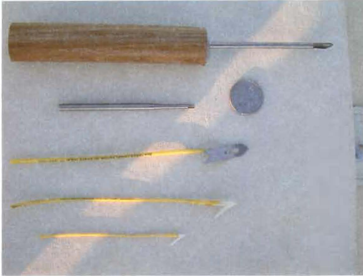
Figure 1. From top to bottom. Tag applicator, slotted tag applicator tip, stainless steel harpoon tag, 5.75 inch nylon dart tag, and 3.75 inch nylon dart tag.