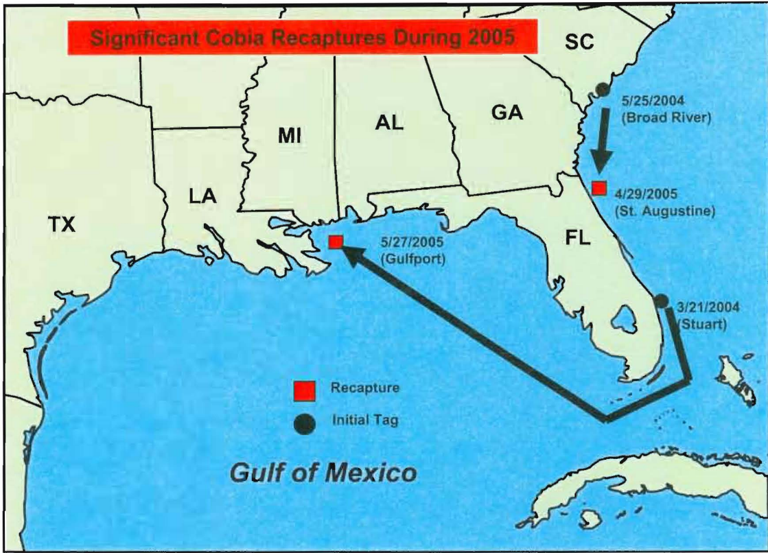
Figure 3. Two of the more significant cobia recaptures that occurred during 2005.