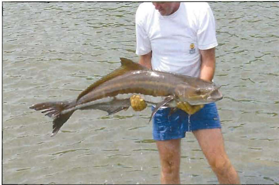
Cobia, Rachycentron canadum