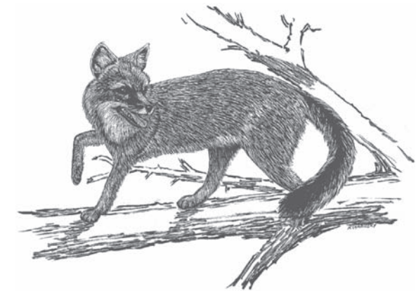
Gray Fox (Urocyon cinereoargenteus)

SC Department of Natural Resources Wildlife & Freshwater Fisheries Division