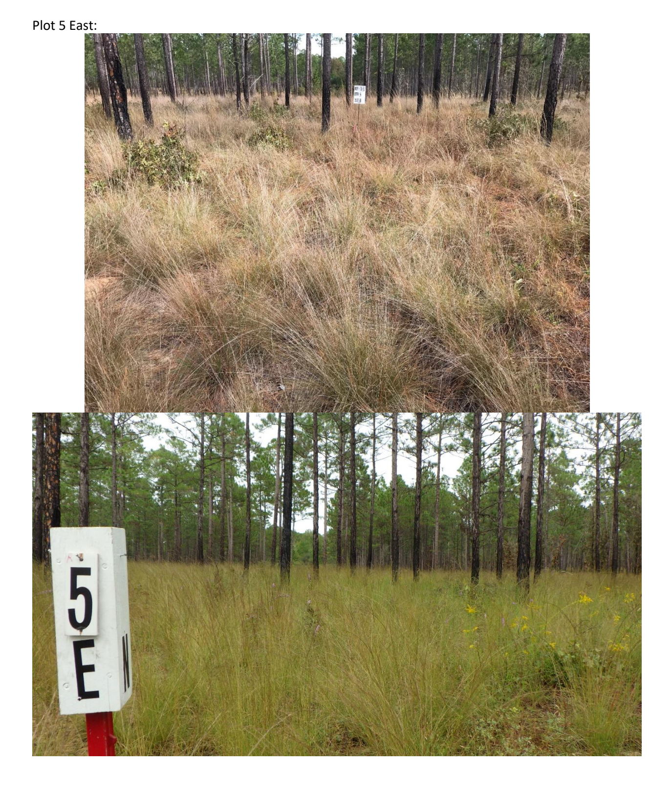
PLOT 5: Reference Condition at TSRHP