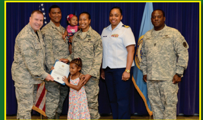
"A promotion to Technical Sergeant is one of the hardest in the United States Air Force. I've been blessed to share this accomplishment with my lovely family, great friend (member of the United States Coast Guard), and the White House Communications Agency Command!"