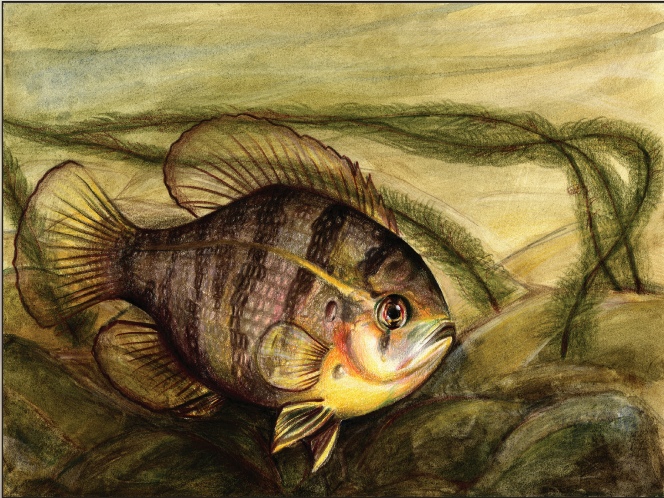
Angelica Halvarsson Grades Category 10-12