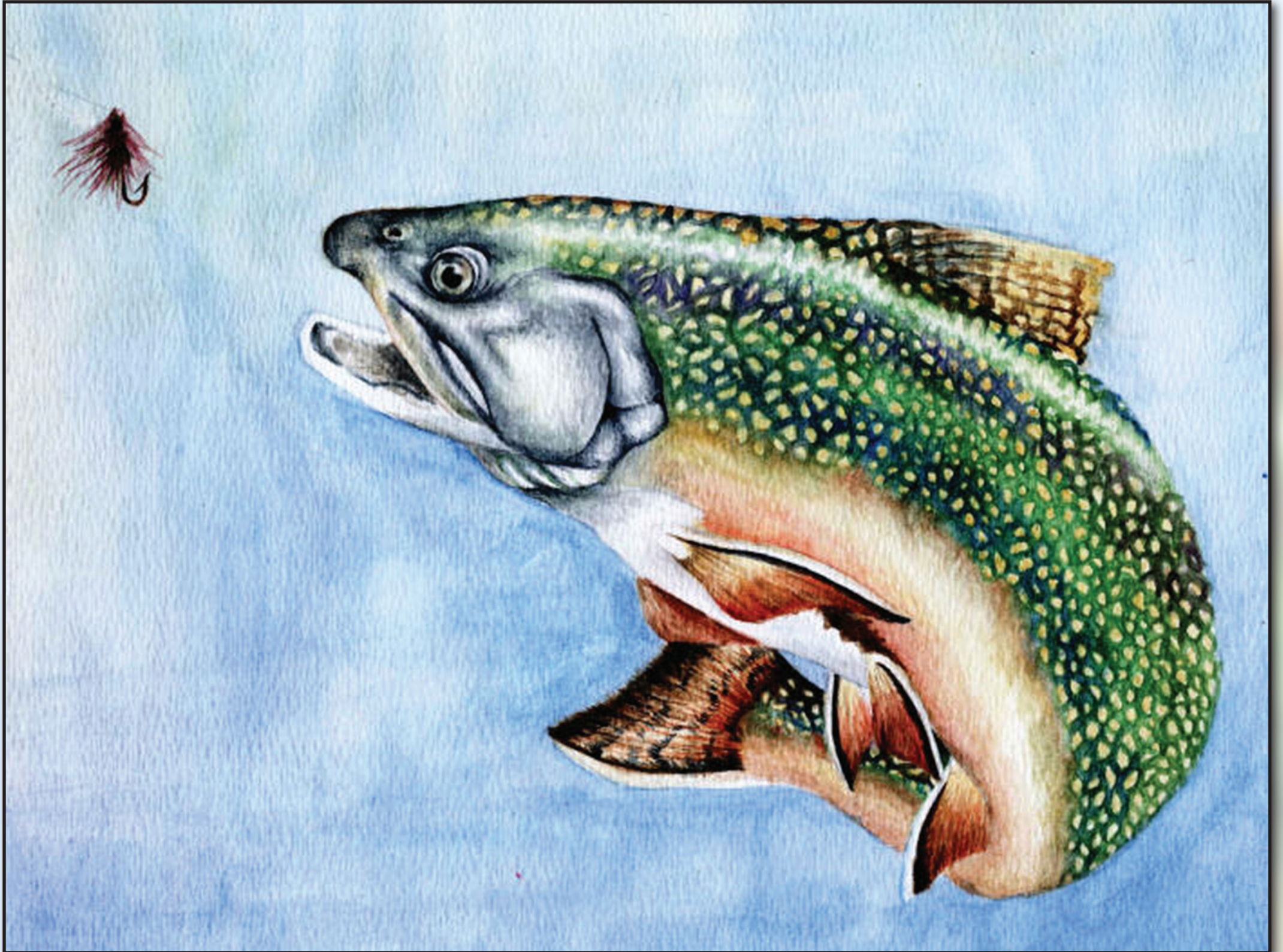
Stephanie Potts Grades Category 10-12