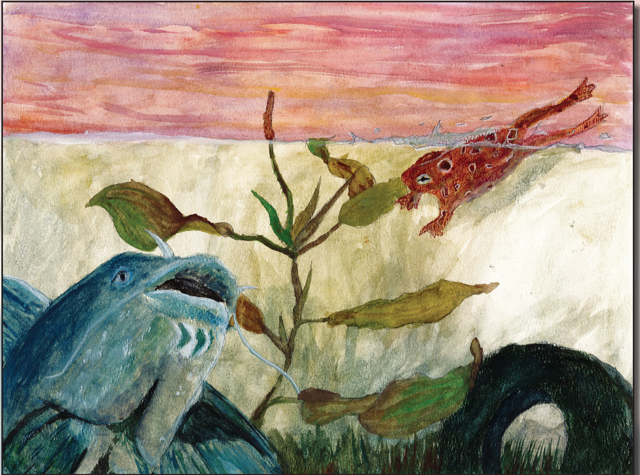
Areli Peña Grades Category 10-12