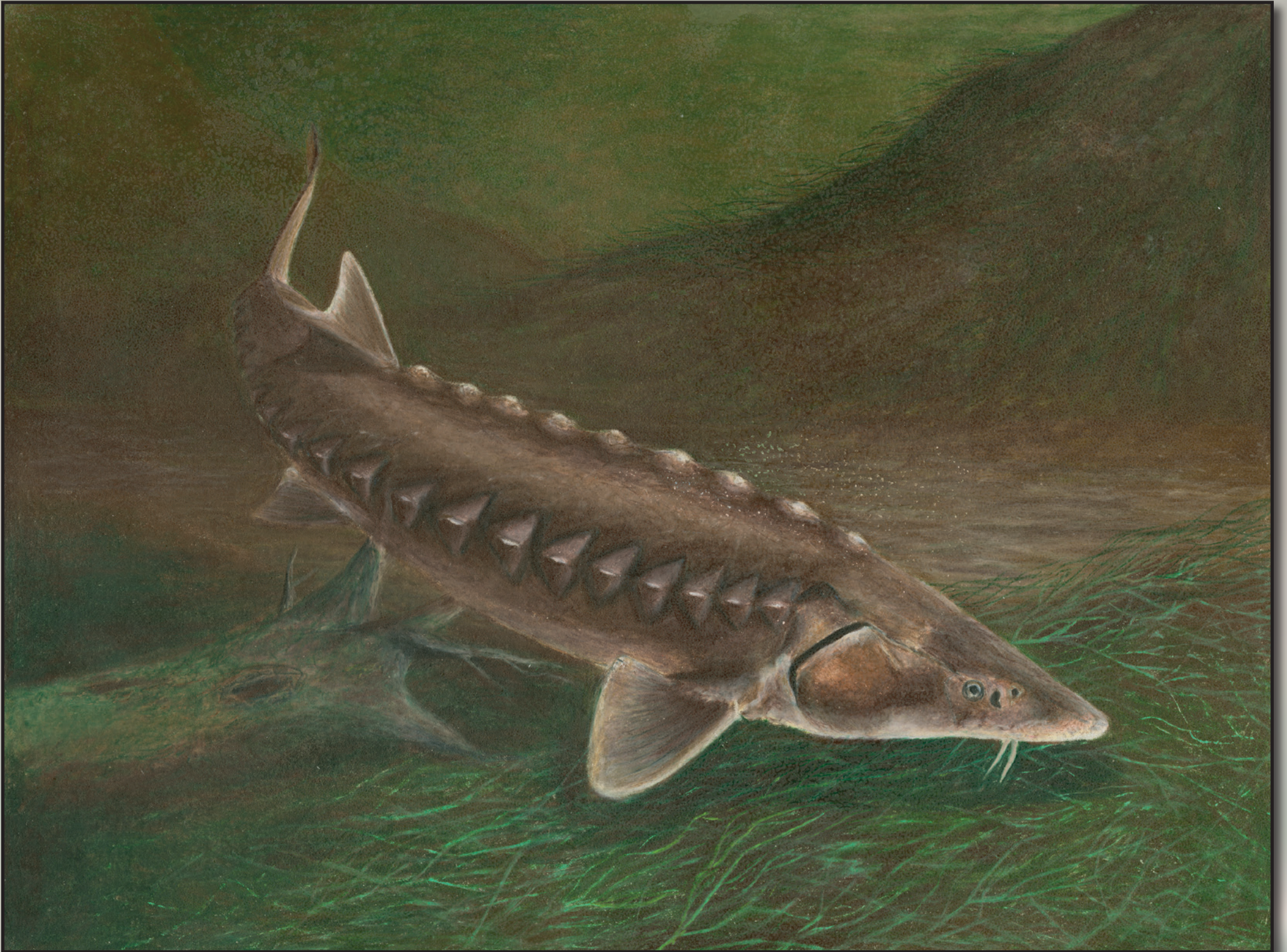
Ethan Lopez Grades Category 7-9