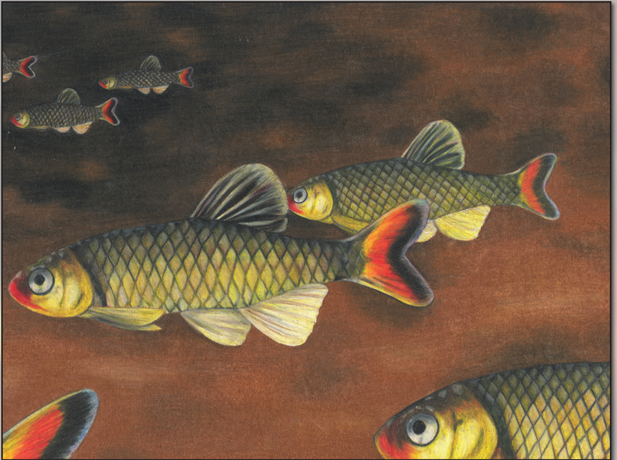
Kelly Kemp Grades Category 10-12