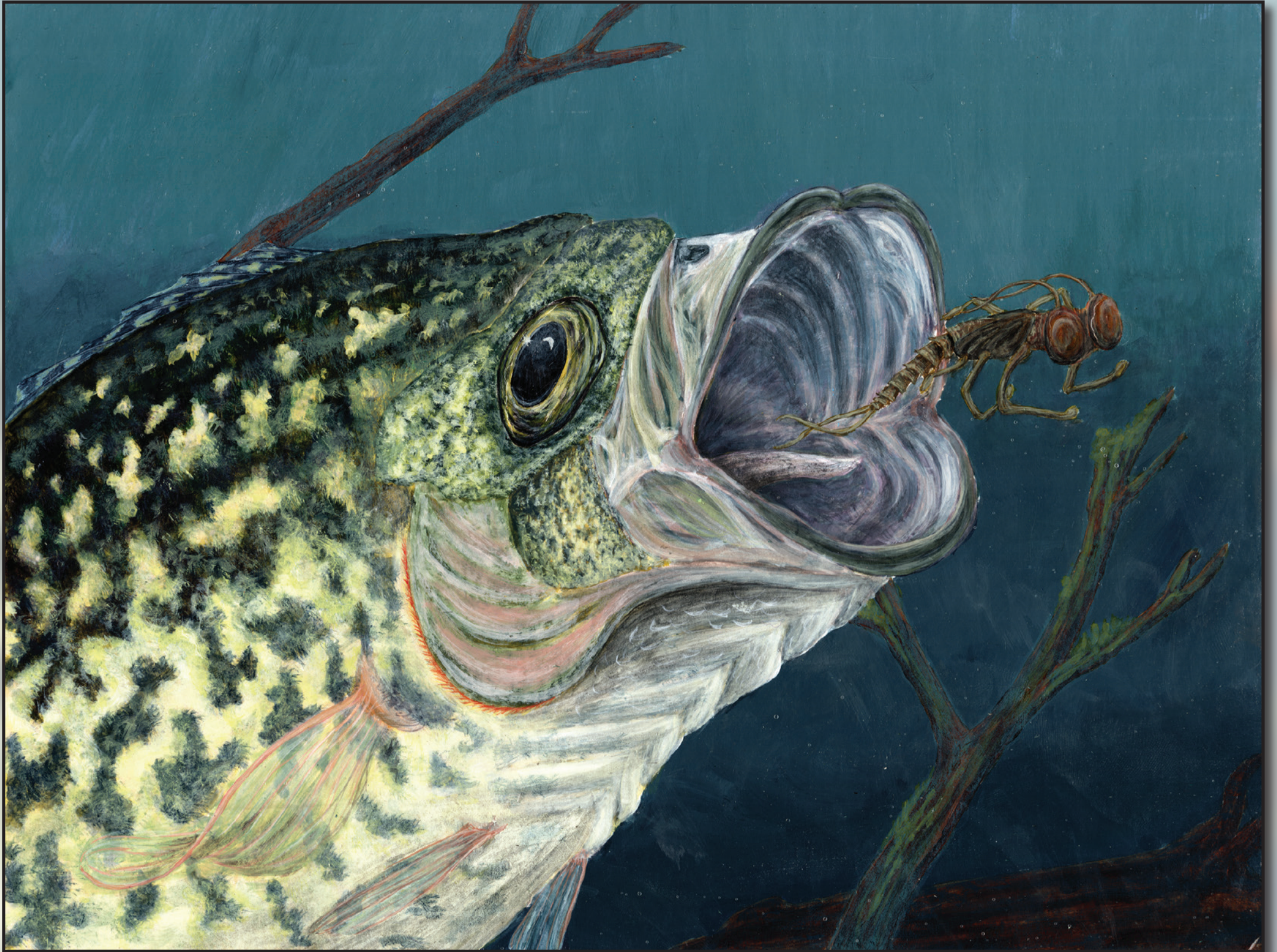
Ellen Vance Grades Category 10-12