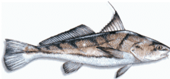
Northern Kingfish http://www.state.nj.us/dep/fgw/artkingfish.htm

Freshly caught kingfishes are relatively easy to tell apart by their coloration. The northern kingfish has dark, angular bands along the sides of their body. The Gulf kingfish has a silvery color as well as a darker area on the tail fin (mainly on the dorsal lobe or the top portion).