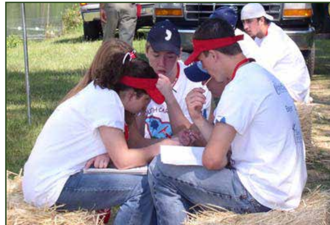
A team of students work together to complete the forestry test.

The winning team goes on to represent South Carolina at the North American Envirothon which is hosted by a different state or Canadian Province each year.