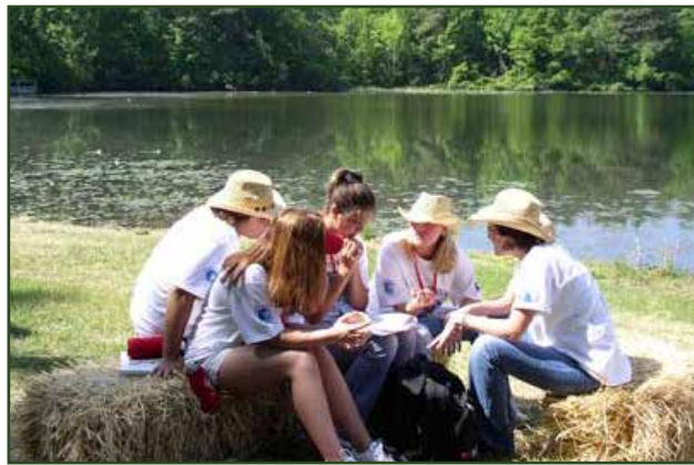
Teams have the opportunity to get "up close and personal" with South Carolina's natural resources.

The 2019 Envirothon Coaches Training is scheduled for Saturday, 2/9/19 at Clemson Sandhill REC in Columbia. The 2019 SC Envirothon Competition will be held on Friday, 4/12/19 at Clemson Sandhill REC. For information email: myrickd@dnr.sc.gov .