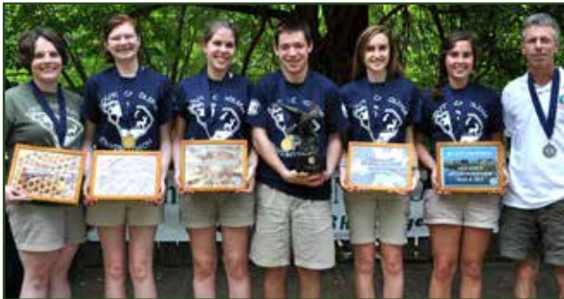
The first-place team in the state goes on to the Envirothon's North American competition.

The South Carolina Envirothon is an annual hands-on environmental problem-solving competition for high school students. Participating teams compete for recognition and scholarships by demonstrating their knowledge of environmental science and natural resource management. The Envirothon competition tests the student's knowledge on topics such as soils, aquatics, forestry, wildlife and current environmental issues.