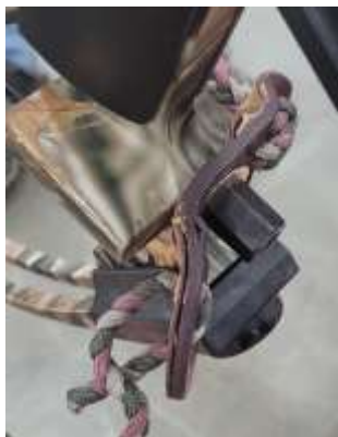
This style bolt is permitted.