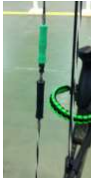
Not permitted, two bottom pieces.

3.5.3. Heat shrink tubing may be placed on the bowstring to reduce finger strain, but the tubing must cover the entire center serving above and below the nock locator(s).