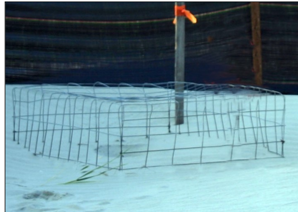
One piece of 4 x 4 foot (2 x 4 inch mesh) welded wire. Cut off 24 square (or 4 feet) length of wire. Cut out four corners as shown above. Fold down and use hog clips to hold together. Design courtesy of Sarah Dawsey, USFWS.