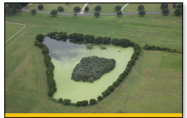
Egret Rookery, very similar to the appearance of a wood stork rookery.