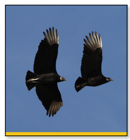
Black Vulture.

60 inches of horizontal separation and 48 inches of vertical separation. In areas with potential wood storks, the vertical separation should be increased to 60 inches. Where the minimum distance is not feasible, insulate wires, conductors and other critical equipment to render those components neutral. Cross-arms, insulators and other parts of the power lines should have exclusion devices or perch discouragers installed to prevent birds from landing on energized wires. Artificial bird safe perches and nesting platforms should be placed at a safe distance from the energized infrastructure.