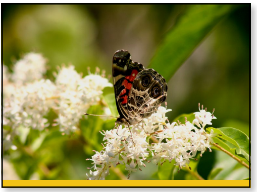
Painted Lady Butterfly.

Identify the soil types on the project site. Contact Clemson Extension<sup>22</sup> and/or the local Soil & Water Conservation District Office. Identify the predominant soil type for the solar site with the NRCS Web Soil Survey.<sup>23</sup> Once the soil type has been identified, contact the local conservation district and discover what the most appropriate native pollinator mix is for the site and at what planting density. The district staff can provide assistance in identifying vendors that can provide these native seed mixes and/or live stakes.<sup>24</sup>