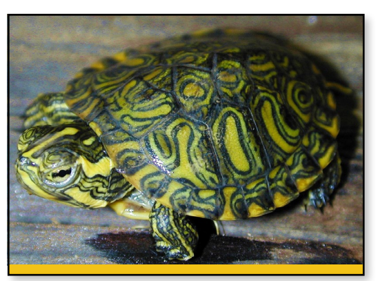
Juvenile Yellow-bellied Turtle.

The USFWS recommends surveys be conducted on the project site and surrounding area for any potential federally listed species, as well as for those that are federally considered an At-Risk-Species (ARS). It is possible that some of the ARS may be listed under the Endangered Species Act (ESA) during the solar farm's operational life. Coordination with the USFWS should