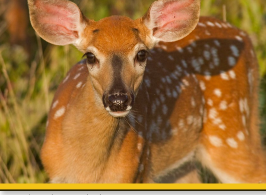
Juvenile White-tailed Deer.

1. rare, declining or designated as at-risk;