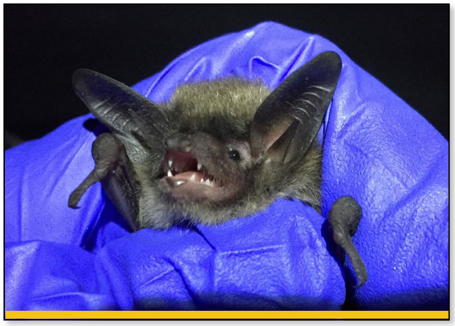
Northern Long-eared Bat.

Again, if the project activities were related to specific forest management, native prairie management, minimal and hazardous tree removal, or maintenance/expansion of existing right-of-ways and transmission corridors, as outlined in the 4(d) rule, an incidental permit would not be needed. During the planning phase of a solar site, check with SCDNR species review staff<sup>21</sup> to see if northern long-eared bat may be present in the project area. Please contact USFWS for further information regarding their consultation process and contact SCDNR or USFWS for survey requirements.