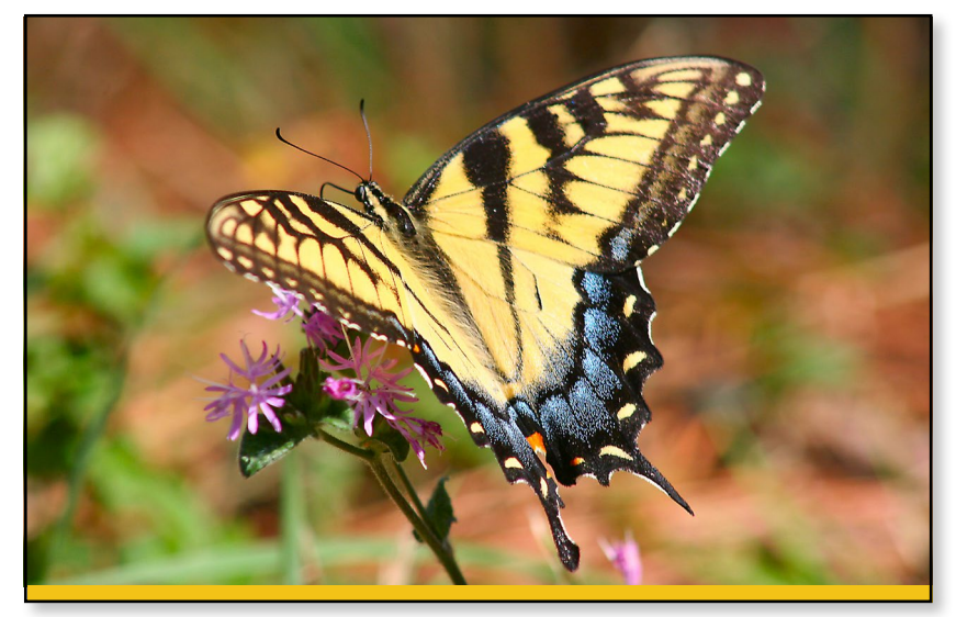
Eastern Tiger Swallowtail. Photo credit: SCDNR Biologist Pam Corwin

When using pesticides, proper application and careful and coordinated timing can significantly reduce pollinator mortality. Use an Integrated Pest Management (IPM) approach which includes proper pest identification, monitoring, and evaluating all available factors in the environment potentially contributing to a pest problem. IPM solutions can include mechanical removal of pests or setting a tolerance threshold. IPM does not mean land stewards automatically use pesticides to eliminate pests. Carefully diagnose your pest problem, and, before you apply a pesticide, make sure the pest population has reached a level where chemical control is necessary. As always, consult with your local County Extension Agent and if a pesticide is needed remember to follow the label instructions. Further information on the rules and regulations regarding pesticides and if the applicator must obtain a pesticide applicators license prior to making a pesticide application in the state of South Carolina can be obtained from Clemson Regulatory Services Department of Pesticide Regulations.<sup>28</sup>