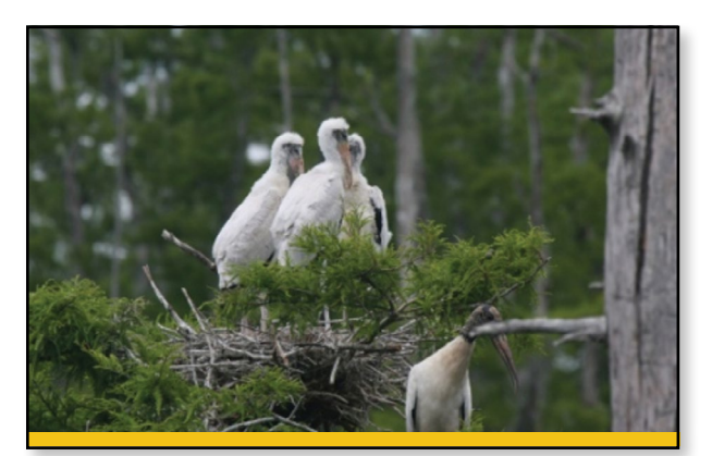
Wood Stork.

Wood stork ( Mycteria americana ) are listed as a federally threatened and state endangered species, as well as protected under the Migratory Bird Treaty Act. Although nesting sites or wading bird rookeries may not be located nearby or on the project site, wood stork and other wading birds may seasonally use the water features located on or near the property. If the project site is within 2,500 feet of a wood stork rookery or within 1,000 feet of a known wood stork roosting area the USFWS must be contacted to determine if additional requirements or actions are necessary. During planning for the solar site, check with SCDNR species review staff<sup>10</sup> to see if wood storks may be present in the project area. Please contact USFWS for further information regarding their consultation process and SCDNR or USFWS for survey requirements.