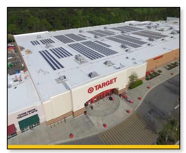
Hannah Solar North Charleston Site.

The least impactful solar installations occur on top of existing human developments. Rooftop arrays, or arrays built on top of existing disturbed surfaces such as landfills, decommissioned industrial sites and parking lots, are best suited for solar power generation and do not require further habitat conversion, fragmentation or degradation when chosen as locations for solar farms. A tax credit is available to an individual or business that constructs, purchases or leases solar facilities on property located on the Environmental Protection Agency's National Priority List, or equivalent sites, and on a list of related removal actions as certified by the SC Department of Health and Environmental Control (DHEC), such as former industrial sites or landfills<sup>1</sup>.