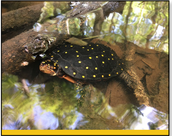
Spotted Turtle

In South Carolina, gopher tortoise are most likely to occur in the Sandhills and Coastal Plain ecoregions of Jasper, Hampton and Aiken Counties; however, there are also known occurrences in Colleton, Dorchester, Bamberg and Allendale Counties. SCDNR recommends gopher tortoise surveys and consultation with the USFWS, in addition to SCDNR, should always occur in the following counties: Aiken, Allendale, Bamberg, Colleton, Dorchester, Hampton and Jasper.