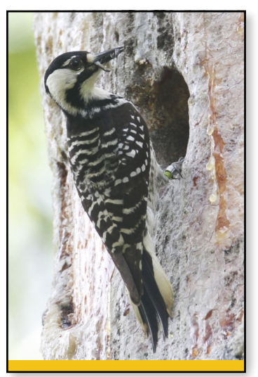
Red-cockaded Woodpecker.

Red-cockaded woodpecker (Picoides borealis) are listed as endangered by the state and federal government, as well as protected under the Migratory Bird Treaty Act. Red-cockaded woodpecker nest in mature pine forests in the Piedmont and Coastal Plain of South Carolina. This species cannot be taken, killed or possessed, nor can their cavity trees be destroyed or disturbed without a permit from the USFWS. Areas of impact must be surveyed by gualified individuals able to identify red-cockaded woodpecker by sight and sound, as well as identify foraging and nesting habitat and the associated cavity trees. All red-cockaded woodpecker cavity trees should be reported to SCDNR via email at rcwreport@dnr. sc.gov. If a red-cockaded woodpecker nest or cavity tree is located within 0.5 miles of the impact area, the USFWS must be contacted to determine if a permit is required. During the planning phase of a solar site, check with SCDNR species review staff<sup>18</sup> to see if redcockaded woodpecker may be present in the project area. Please contact USFWS for further information regarding their consultation process and contact SCDNR or USFWS for survey requirements.