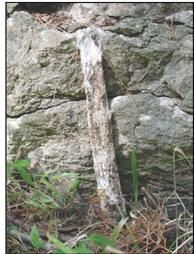
Photo of Sphodros coylei web

Atypus spiders live in silken tubes parallel to the surface of the ground, while Sphodros species usually prop their tubes against a tree trunk. A Sphodros web is very unique, consisting of a tube of silk which extends out of the soil burrow up the side of a tree to about 15 cm (6 in.). The web may be covered with dirt and other debris.