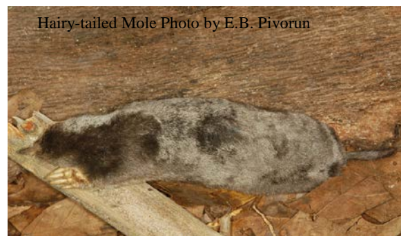
Hairy-tailed Mole

The hairy-tailed mole, first described by Bachman in 1842, is the smallest of South Carolina's moles, ranging from 139 to 174 mm (5.4 to 6.8 in.). The name suggests its identifying attribute, a densely furred tail. The tail is less than one-quarter of the body length. The fur is black to a gray-black on top and slightly paler underneath (Hallett 1978; Laerm et al. 2005b). Both mole species use their tail for fat storage; therefore, tail width varies with season and condition.