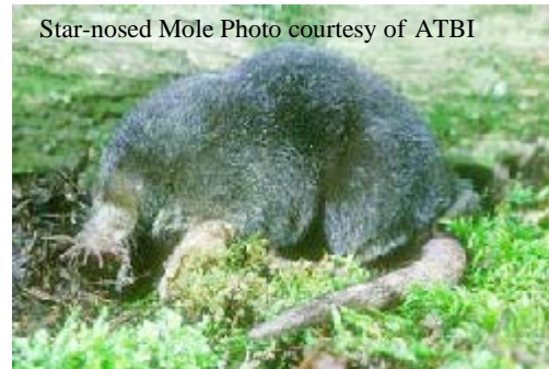
Star-nosed Mole

The star-nosed mole was first described by Linnaeus in 1758. Two subspecies are recognized for the star-nosed mole: Condylura cristata cristata and Condylura cristata parva . Star-nosed moles in South Carolina are considered to be C. c. parva (Peterson and Yates 1980). As the name implies, the rostrum of the star-nosed mole is star-like and consists of 22 fleshy appendages. Total length of this species ranges from 153 to 238 mm (6.24 to 9.3 in.). The moderately haired tail is approximately one-third to one-half the body length. The fur is black or a black-brown on the back (Peterson and Yates 1980; Webster et al. 1985; Laerm et al. 2005a).