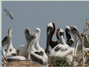
Brown Pelican Nestlings