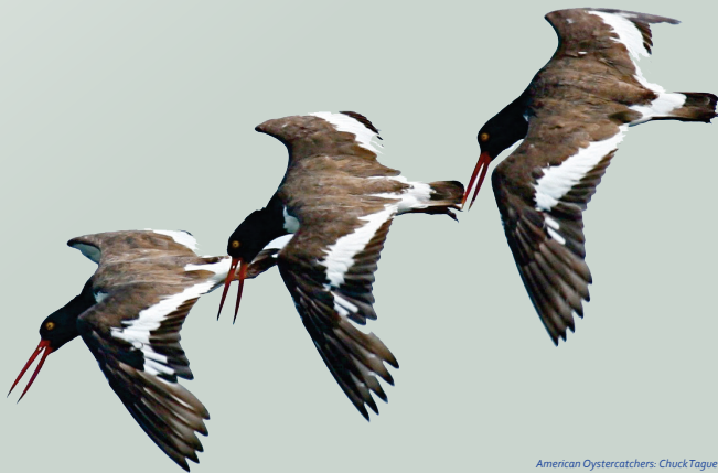
American Oystercatchers: Chuck Tague

Black Skimmer • L 18” • Priority conservation species in SC, declining • Large, black bird with white underparts, neck, and forehead – large, red and black bill with lower bill longer than upper • Nests in groups on bare ground, sometimes with Least Terns • Feeds by skimming surface of water with bill, snapping up prey by feel