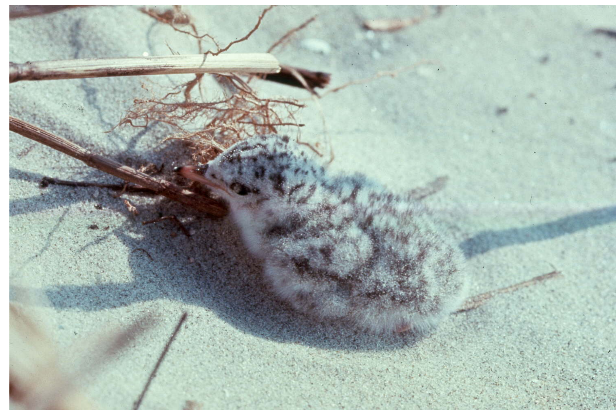
Least Tern chick

Human disturbance is detrimental to beach nesting birds. Camouflaged eggs can be crushed by unknowing humans. When humans approach birds will abandon their nests and unprotected nests become susceptible to overheating or aerial predators. Repeated disturbance is stressful because birds spend more time flying and less time foraging and resting. Because of Yawkey Center's importance to coastal birds and other wildlife, please stay out of closed areas. DOGS ARE PROHIBITED YEAR ROUND anywhere on the island and camping is not allowed May 15 – September 15.