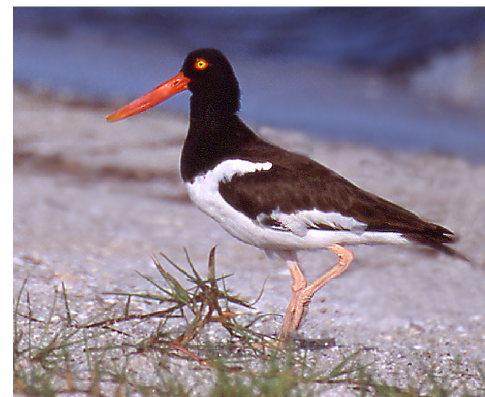
American Oystercatcher adult