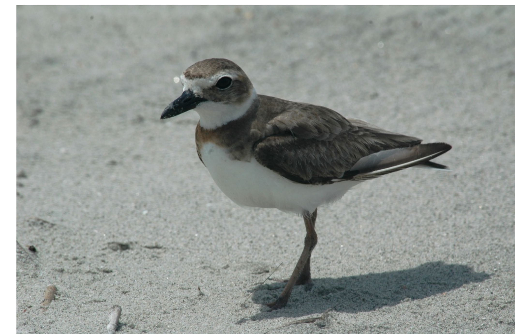
Wilson's Plover adult